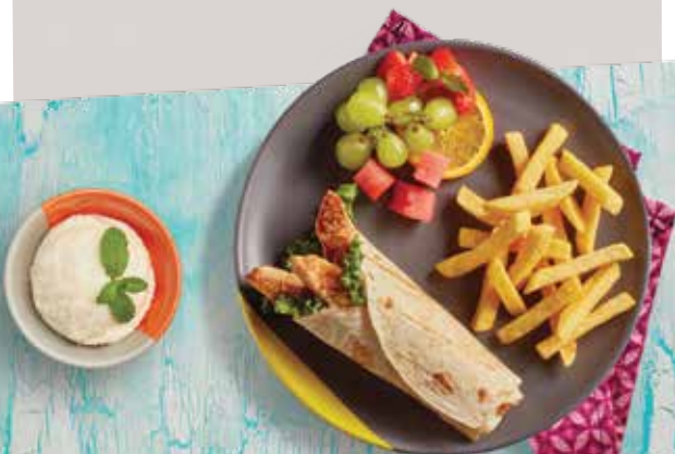
Espetada Carnival A Torre